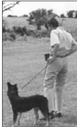
Quickly turn in the opposite direction