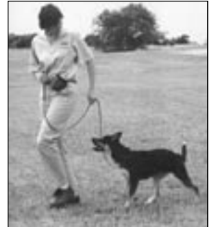
If your dog lags behind, encourage him with praise