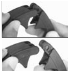
Unsnap the links using a firm left-to-right rocking motion

Add-A-Link™ links are available in Large and Small.