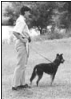
1. Wait for your dog to look away from you