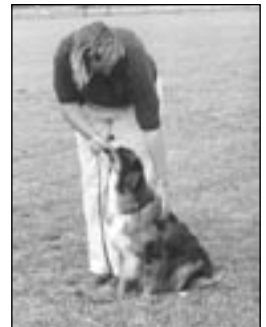
3. Praise and reward your dog