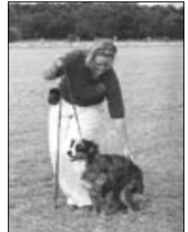
2. Pop upwards while helping your dog into the sit position