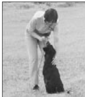
5. Praise and reward