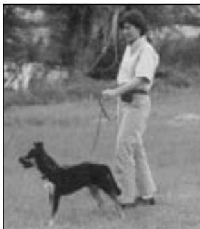
2. Wait until your dog looks away, and then call him