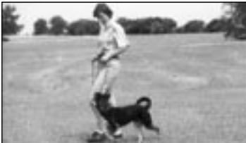
1. Slow your pace as you come to a halt