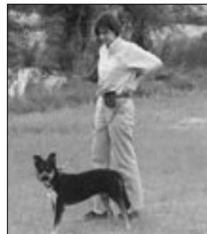
3. Quick pop of the leash