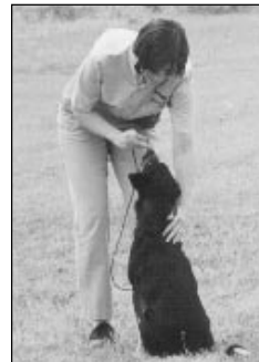
4. Praise your dog