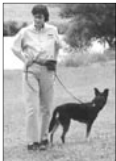
2. Call your dog and pivot. Keep your hand close to your hip