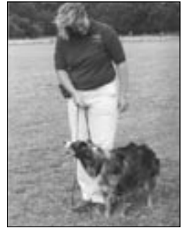
1. Start Position - Give "Sit" command

Equipment: The StarMark Crown Collar™, 6-foot leash, bite-sized treats, and treat