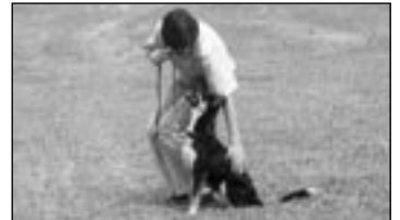
3. Praise and reward