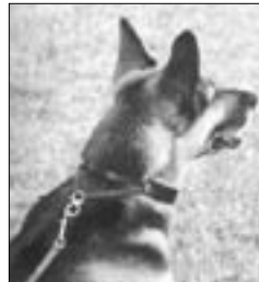
1. Note the Loose leash