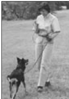
3. Face your dog as he turns toward you