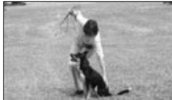
2. Pop up and push down on hindquarters