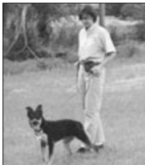
1. Step five feet away from your dog