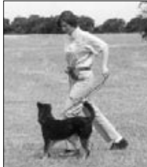
If your dog forges ahead, pop the leash backward