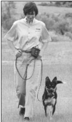
Walking on a loose leash