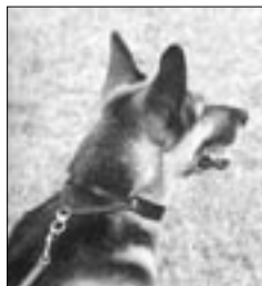
3. Immediately loosen the leash after the pop