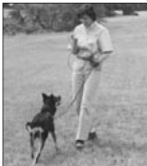
4. Praise and walk backward