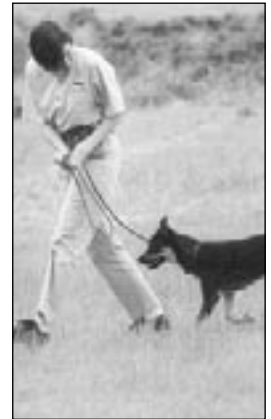
If your dog lags behind, encourage him with praise