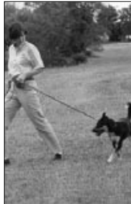
If your dog sways left, quickly turn right