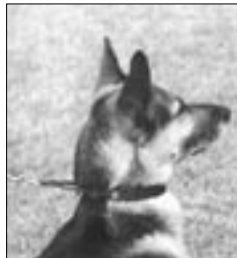
2. Quickly pop and release, using your wrist